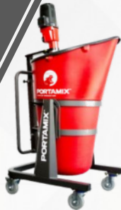
Hippo Mixing Unit