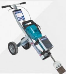
Makinex Jackhammer Trolley