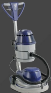
Wirbel Buffer Grinder