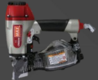
Pneumatic Coil Nailer