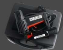
Electric Stapler Bradder

A deposit is required for hiring. Proof of identity is required. Prices are ex. VAT. Delivery charges may apply.